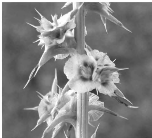
Fig. 7. Salsola australis subsp. Lucid , fruiting branch showing the well-defined rose coloured band at the base of wings of the fruit. — R.J.Chinnock 10212

Salsola kali var. leptophylla Benth., Fl. Austral. 5: 207 (1870).